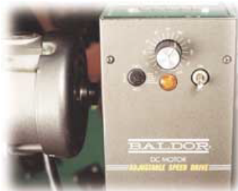
OPTIONAL DC VARIABLE SPEED CONTROLLER

ELECTRICAL CONTROLS: Magnetic starter (one direction or reversible); One direction manual starter; Momentary start/stop push button station; Forward/reversing /stop push button station. Mounting and pre-wiring for units up to 12' long.