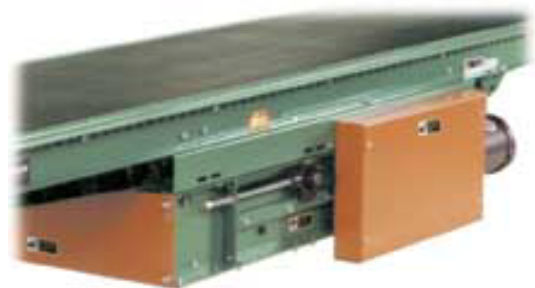
OPTIONAL CENTER DRIVE