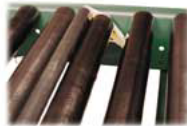
ZONE ACTIVATOR SENSOR