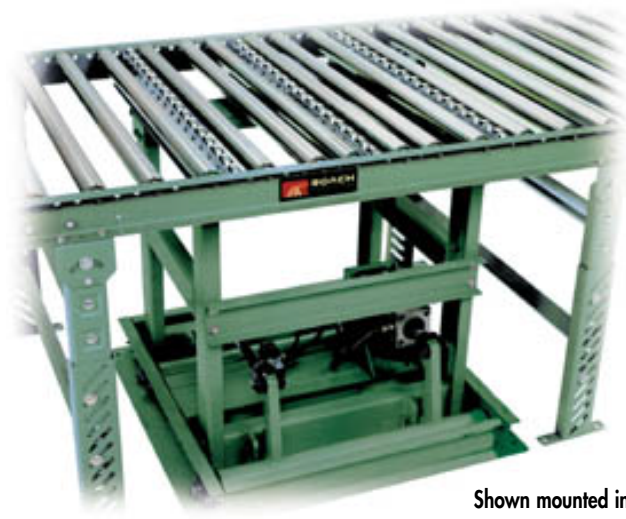
Shown mounted in optional conveyor