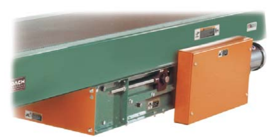
OPTIONAL CENTER DRIVE